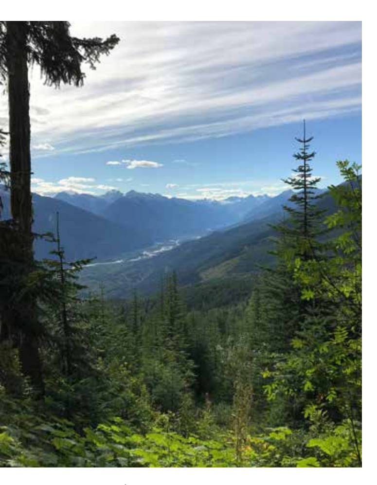
VIEW OF LIL WATATKWA7 (LILLOOET RIVER VALLEY) FROM THE TENQUILLE LAKE TRAIL.