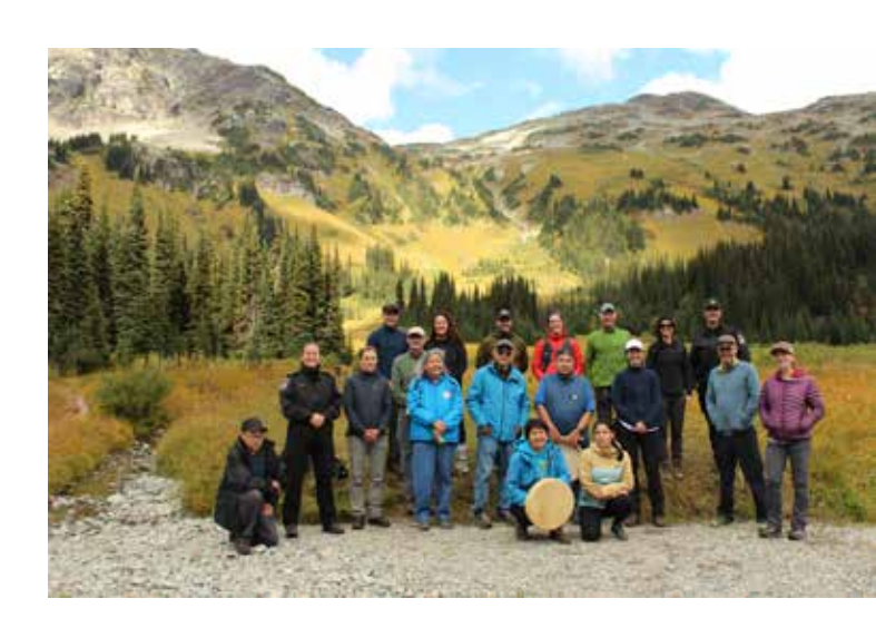
PROJECT PARTNERS AT TENQUILLE LAKE, SEPTEMBER 2021.

Líl wat Forestry Ventures manages a forestry tenure in the Tenquille Creek area, accessed via the Birkenhead FSR. There are three registered traplines and numerous mineral titles in the area.