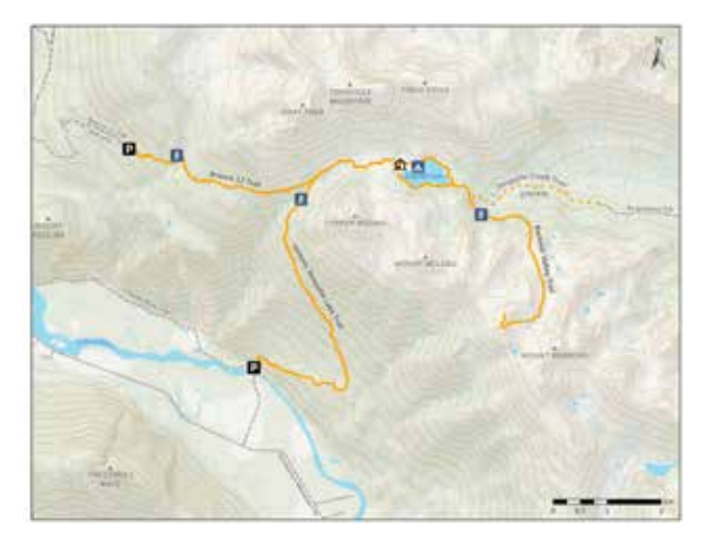
FIGURE 2: MAP OF THE TENQUILLE LAKE AREA

a public cabin (built and maintained by the Pemberton Wildlife Association) and a campground at the west end of the lake. There are two main hiking trails into Tenquille Lake, accessed from the Lillooet North FSR and Branch 12 of the Hurley River FSR (see Figure 2).